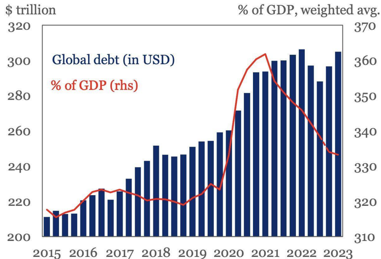
Chart 1: Global debt surpassed $300 trillion in Q1 2023

INFLATION might not be that "bad", after all. Although global debt surpassed the $300trn mark, the debt / GDP ratio has come down.